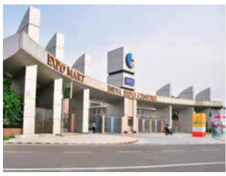
India Expo Mart, Greater Noida