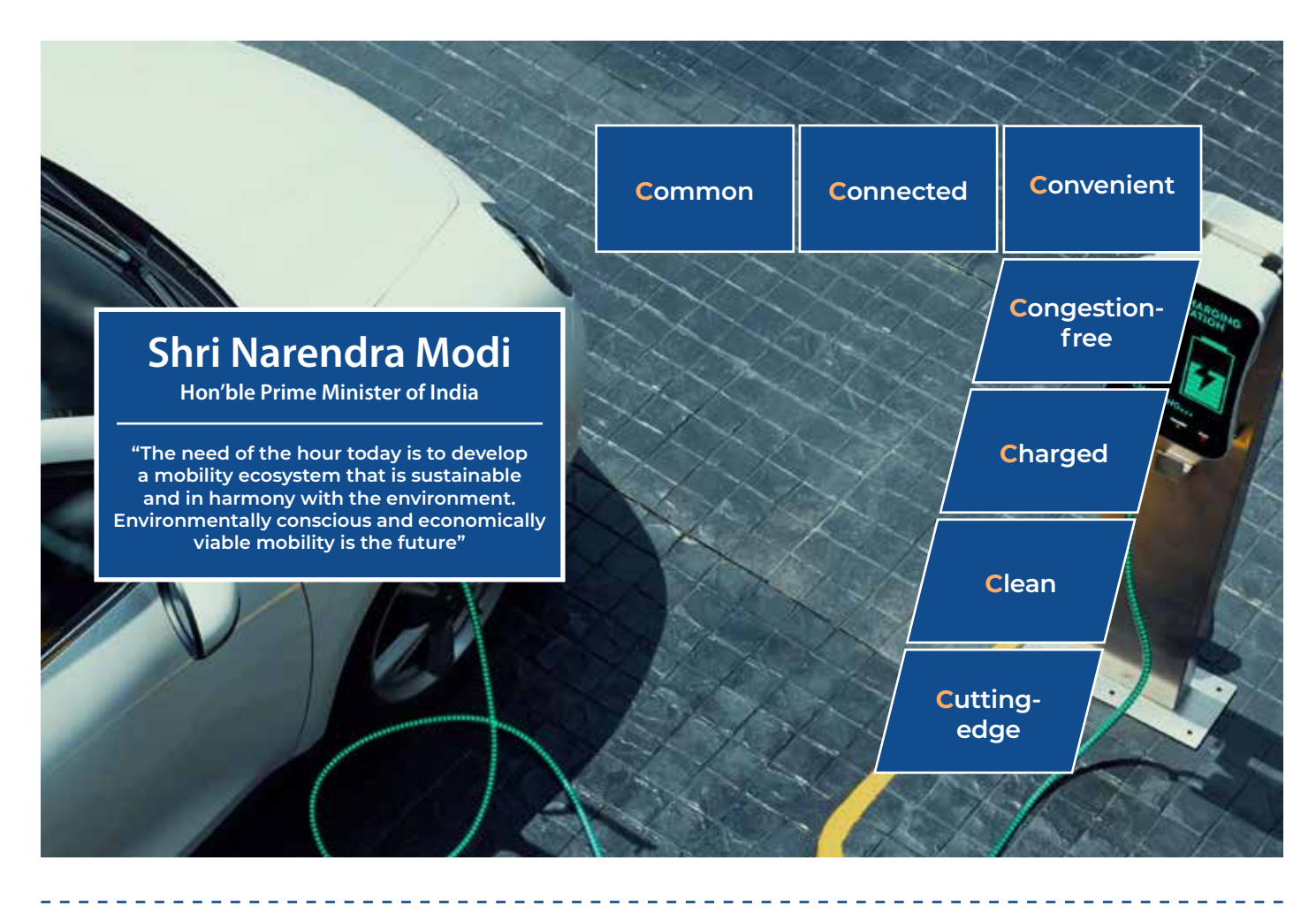
Exhibit your products and solutions