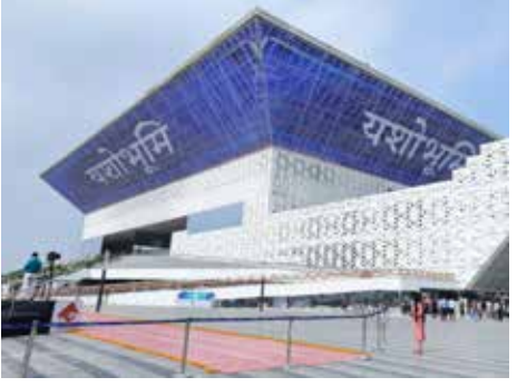
Yashobhoomi, Dwarka, New Delhi